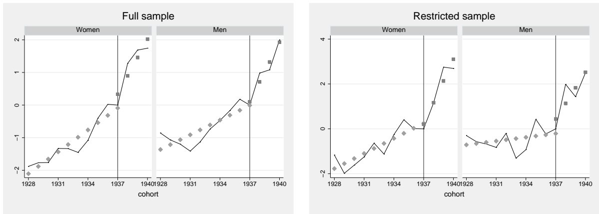
Figure 1: Change in the average retirement age (in months) with respect to the 1937 birth cohort (solid line) and its piecewise linear fit (dots).

NOTE.— Based on individuals between age 62 and 65.